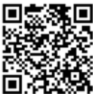
Rosary Leaders Signup