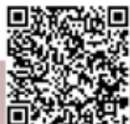
Message from the Bishop

Scan the QR codes for a special message from the Bishop, important details about this journey, and to reserve your seat!